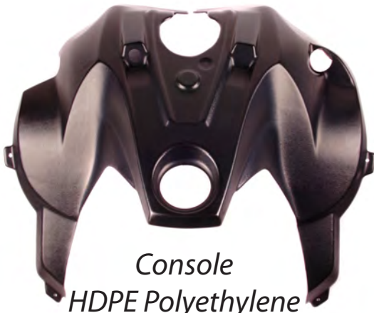
Console HDPE Polyethylene