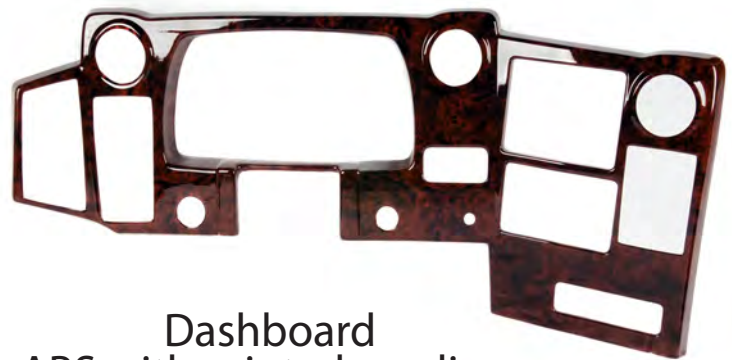
Dashboard ABS with printed acrylic cap